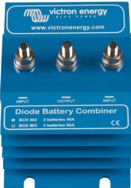
Argo Diode Battery Combiner BCD 802

Diode Battery Combiners are used to guarantee continuous DC power to mission critical equipment, such as an electronic engine control system. With a diode battery combiner two or more DC power sources can be used in parallel to supply the mission critical load. Failure of one source will not interrupt power to the critical load.