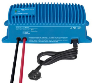
Blue Smart IP67 Charger 12/25