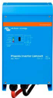
Phoenix Inverter Compact 24/1600

The possibilities of paralleled high power inverters are truly amazing. For ideas, examples and battery capacity calculations please refer to our book 'Energy Unlimited' (available free of charge from Victron Energy and downloadable from www.victronenergy.com ).