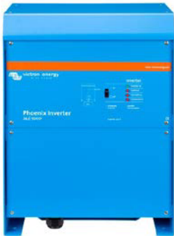
Phoenix Inverter 24/5000