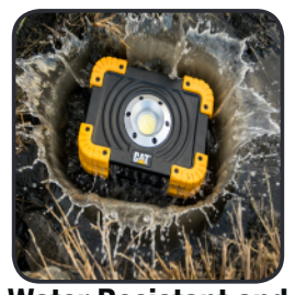
Water Resistant and Bumper Protected