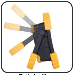
Ratcheting Stand and Handle