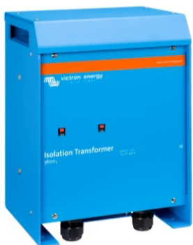
Isolation Transformer 3600W