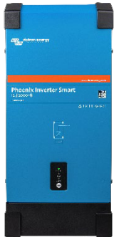
Phoenix Inverter Smart 12/2000