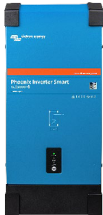
Phoenix Inverter Smart 12/2000