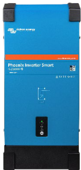
Phoenix Inverter Smart 12/2000