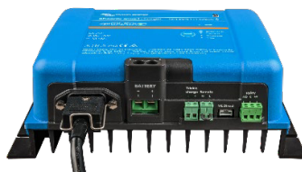
Phoenix Smart 12/50(1+1)