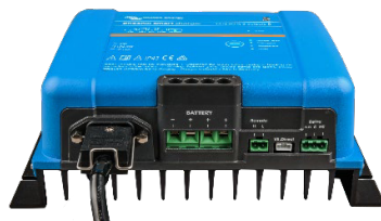
Phoenix Smart 12/50(3)