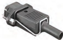
Retainer clip (included)