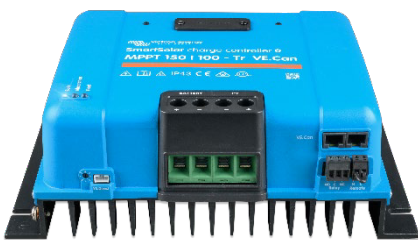
SmartSolar Charge Controller MPPT 150/100-Tr VE.Can without display