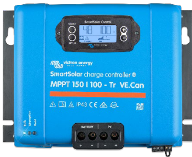
SmartSolar Charge Controller MPPT 150/100-Tr VE.Can with optional pluggable display