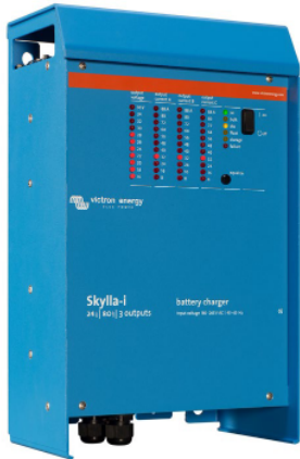
Skylla-i 24/100 (3)